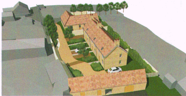
Site - Aerial Overview From South