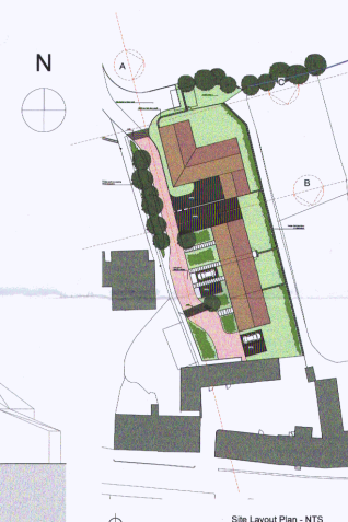
Site Layout Plan - NTS

THIS COPY HAS BEEN MADE BY OR WITH THE AUTHORITY OF BRAMHALL BLENKHARN ARCHITECTS BY SECTION 44 OF THE COPYRIGHT ACT 1988 AND NOT BY THE LANDLORD. THE COPY MUST NOT BE LOANED WITHOUT THE WRITTEN PERMISSION OF THE COPYRIGHT OWNER.