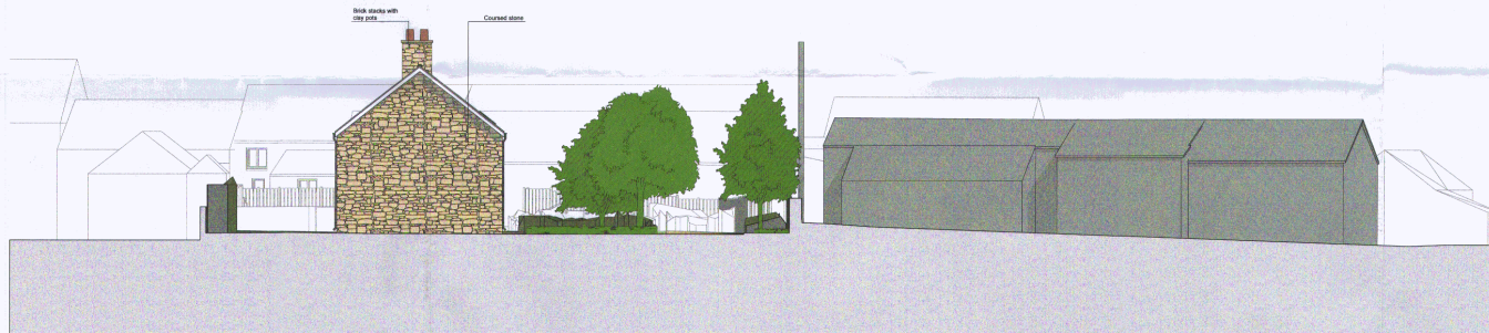
Site Section B - Scale 1:100