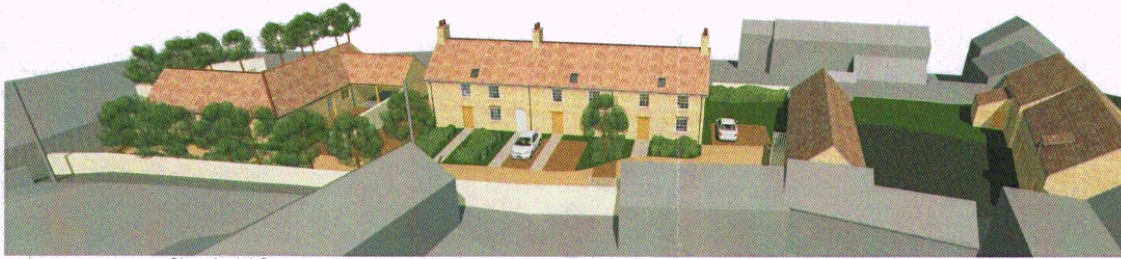
Site - Aerial Overview From West