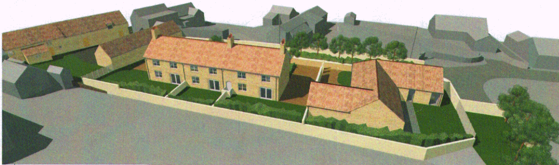
Site - Aerial Overview From East

THIS COPY HAS BEEN MADE BY OR WITH THE AUTHORITY OF RYEDALE DISTRICT COUNCIL PURSUANT TO SECTION 47 OF THE COPYRIGHT, DESIGN AND PATENTS ACT 1988. UNLESS OTHERWISE STATED, THIS PERMISSION TO REPRODUCE THIS COPY MUST NOT BE COME WITHOUT THE PRIOR PERMISSION OF THE COPYRIGHT OWNER.