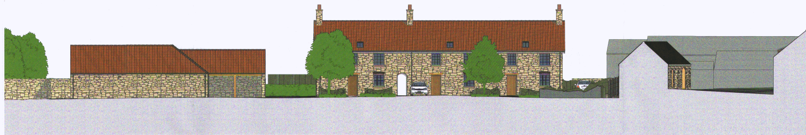
Site Section A - Scale 1:100