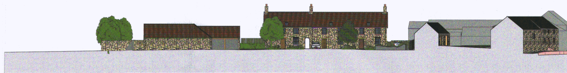
Site Section A - Scale 1:200