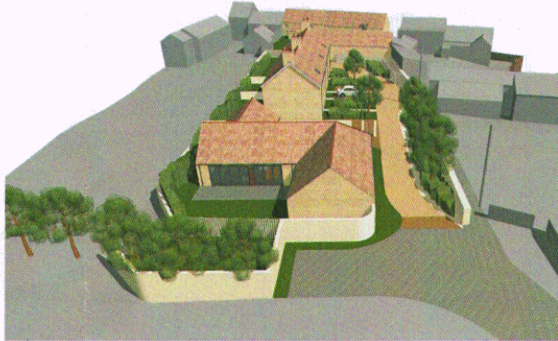
Site - Aerial Overview From North